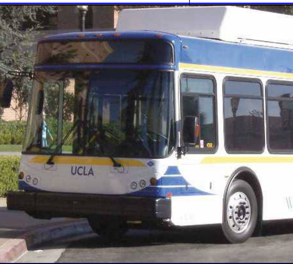
One of the many shuttle buses on the UCLA campus

Down in the Sunshine State, the University of Florida (UF) in Gainesville likes to boast about the U.S. Environmental Protection Agency (EPA) naming the campus one of the best workplaces for commuters among colleges and universities. Criteria for the designation include being committed to improving air quality, saving energy, reducing traffic congestion, and improving employee quality of life.