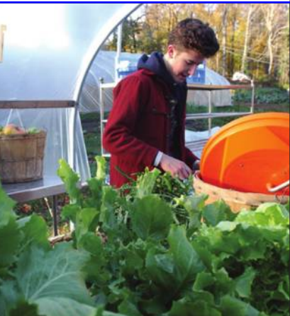
Food grown at Yale University's organic gardens is used in meals served at on-campus cafeterias. Nearly 40 percent of all food served there is now organic or locally purchased.

Cattle require large amounts of water to raise, and they produce a form of methane that is 23 times more potent than carbon dioxide as a greenhouse gas.