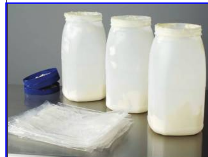
Kraft’s new Easyprep pouch for products such as Kraft Mayo, Miracle Whip, and salad dressings cut packaging waste by 95 percent when compared to a rigid gallon container.

The green movement has been felt by the nation’s food service management firms as well. In the past five years, Bon Appétit Management has watched the concept of using sustainable foods go from radi-