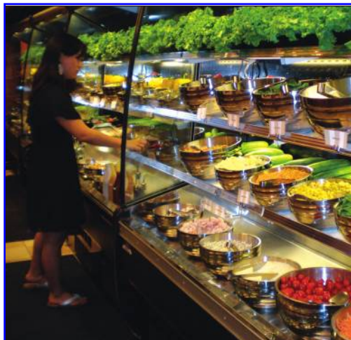
Colleges such as Duke University are getting rid of serving trays in an effort to reduce food waste, conserve water, reduce soap use, and save money.